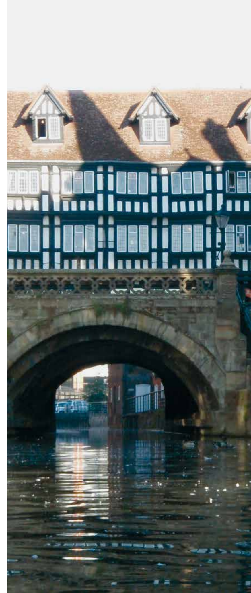
The Glory Hole, Lincoln, River Witham.