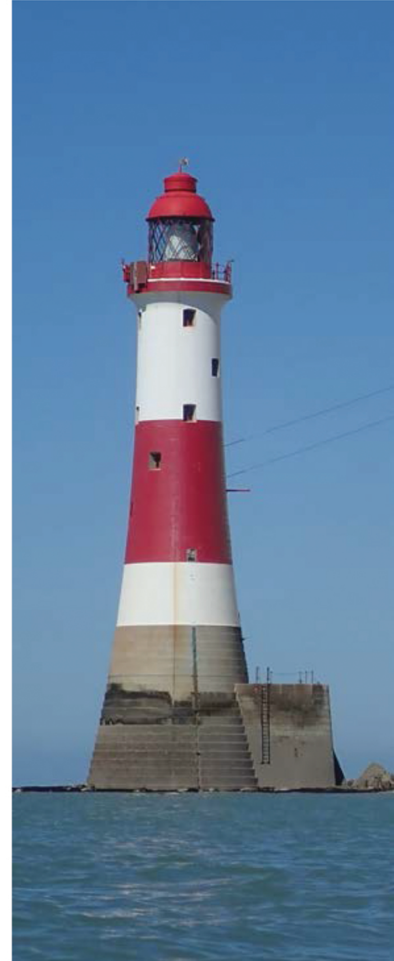
One of the best known British lighthouses, Beachy Head.