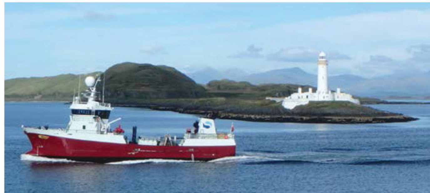
Eilean Musdile with its lighthouse.