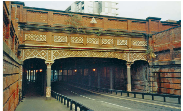
Holliday Street Aqueduct.

Adjacent is the Mailbox, formerly housing Birmingham's mail sorting office and now occupied by shops, restaurants and the BBC.