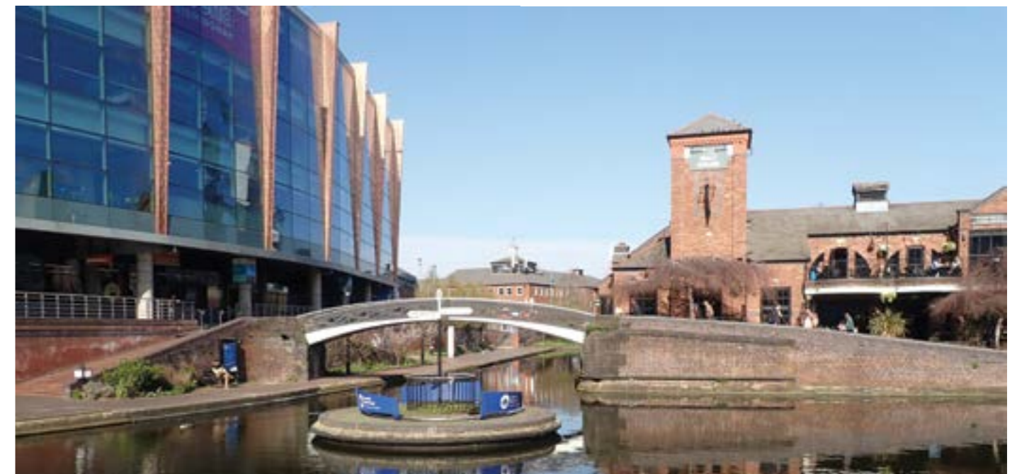
Old Turn Junction with the Utilita Arena Birmingham, Birmingham & Fazeley Canal and Malt Shovel.