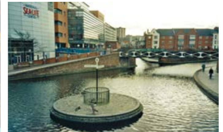
Old Turn Junction with the Main Line crossing.