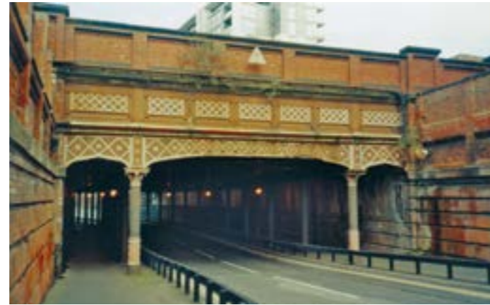
Holliday Street Aqueduct.