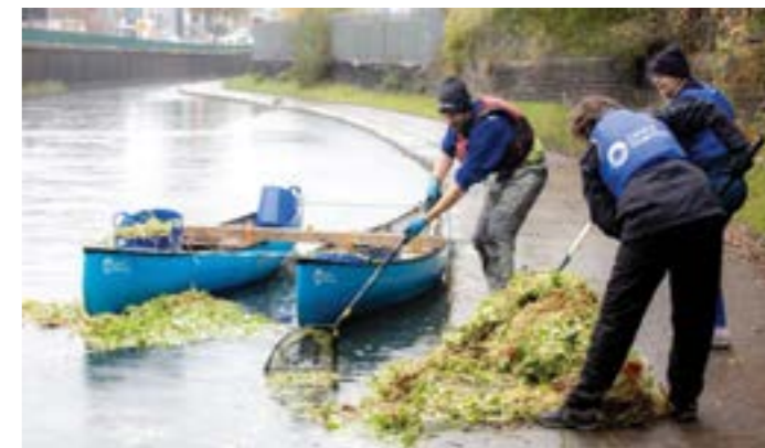
CRT are raising funds to tackle floating pennywort on the River Soar. The most effective way to deal with it is to pull it out physically. The weed can grow 200mm per day and double its weight in three days.