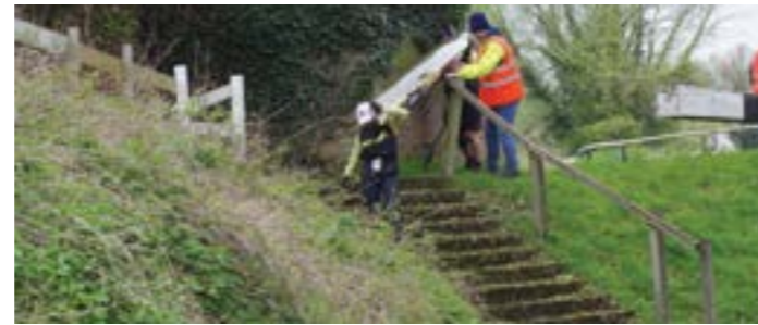
Bending the fence to permit the Garston portage.