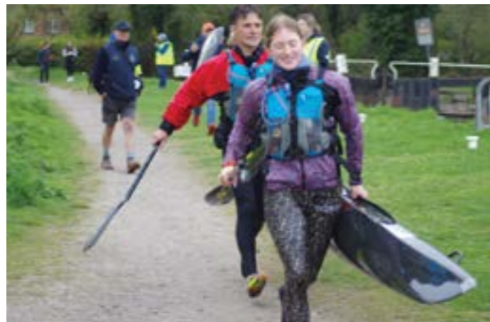
Running the Sheffield Lock portage.