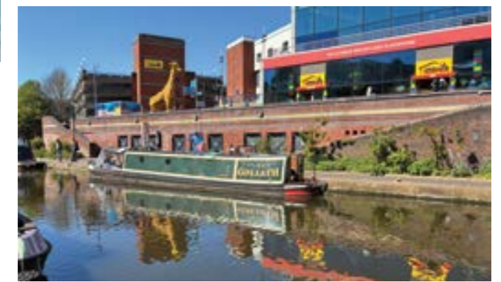
The Duplo giraffe and Lego Playground.