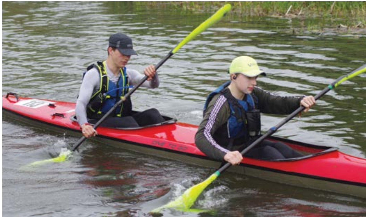
Under 17 schools winners Barr/Hulton.