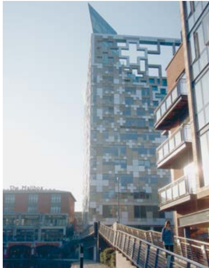
The Cube and the Mailbox.

Birmingham's Gas Street Basin is usually reckoned to be the centre of Britain's canal system. Surely no other 600m straight packs in so much of interest.