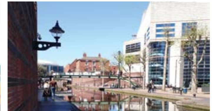
The International Convention Centre.

A full sized Duplo giraffe draws attention to the new Lego Playground.