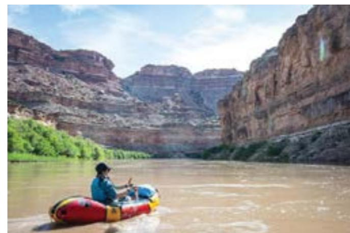
The Thule Keswick Mountain Festival over May 15-17th has teamed up with Visit Utah. With a wide selection of outdoor activities, it includes the grade 3-4 Green River, the grade 4-5 Colorado and plenty of calmer rivers, lakes and reservoirs across the state.