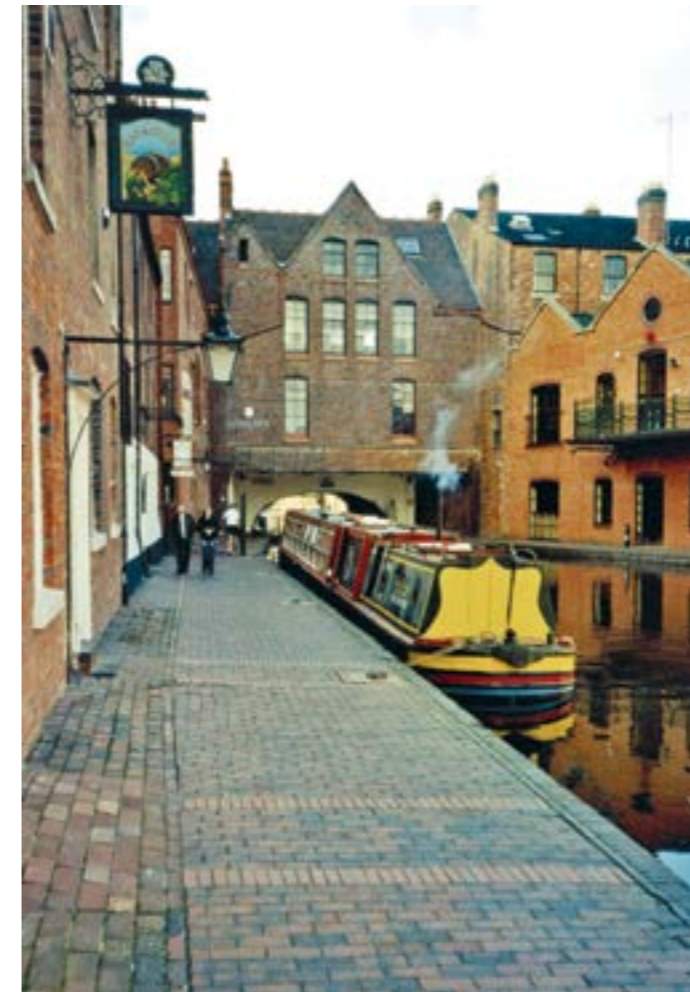
Black Sabbath Bridge.

At Old Turn Junction the Main Line bears left, the Ouzells Street