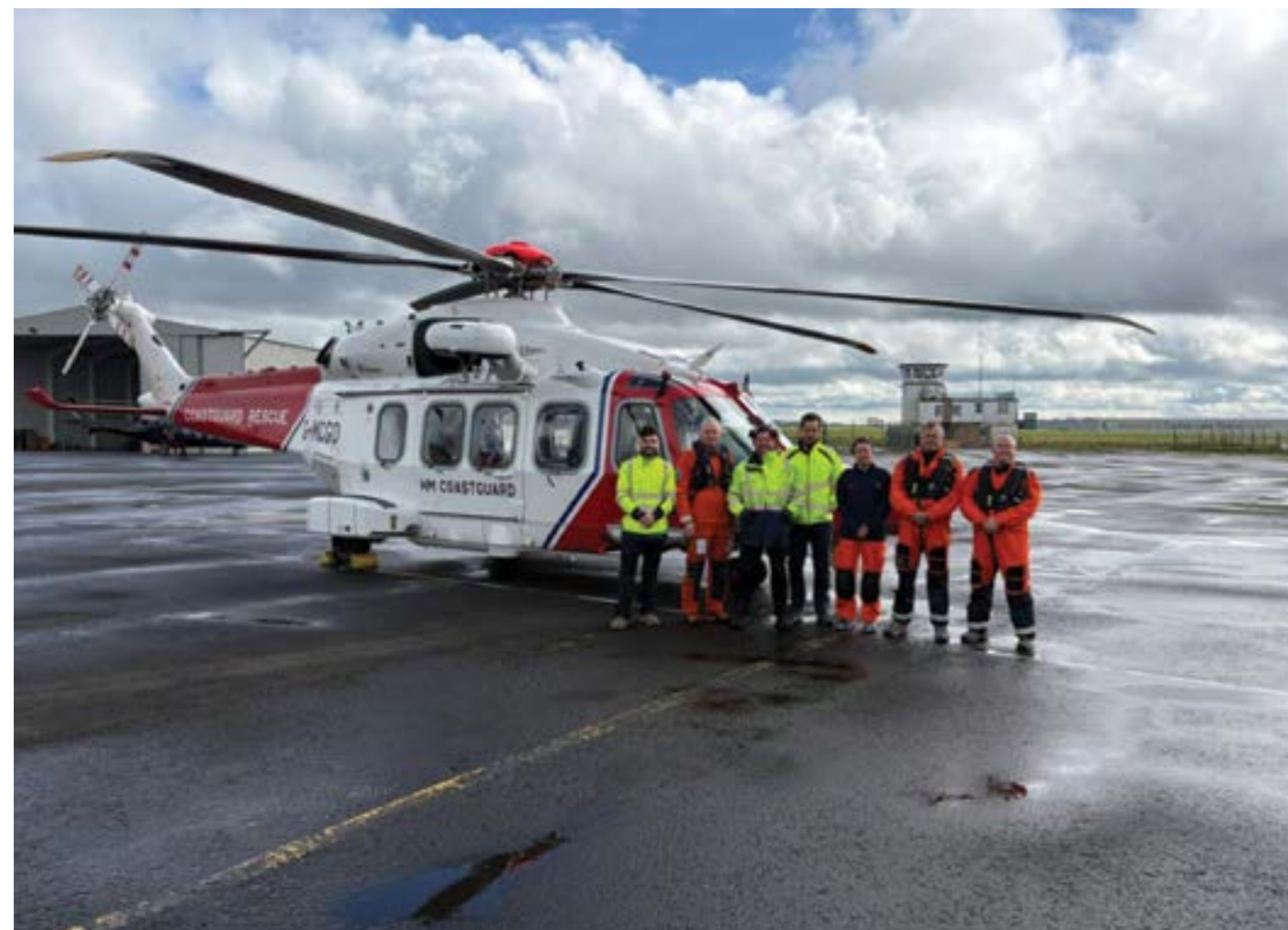
Carlisle's new search and rescue helicopter.

HM Coastguard have opened two new Search & Rescue bases using AugustaWestland 189 helicopters as are being used at some other of their ten bases. The new bases are at Oban and Carlisle to operate in summer months to assist locations where frequency of incidents has been shown to be higher. This seems to be a reversal of the policy of closing bases to save money and is to be welcomed.