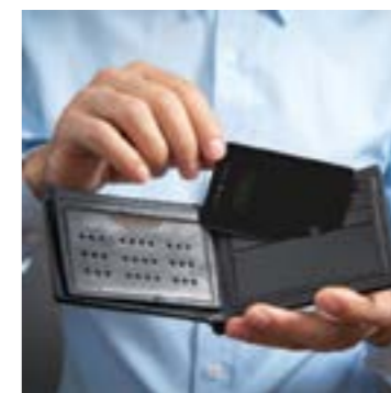
Tagsley have a tracking card which is just 1.8mm thick so it can be hidden away in a canoe. It works with Apple Find My, a two hour charge providing five months of cover. There is no subscription cost.