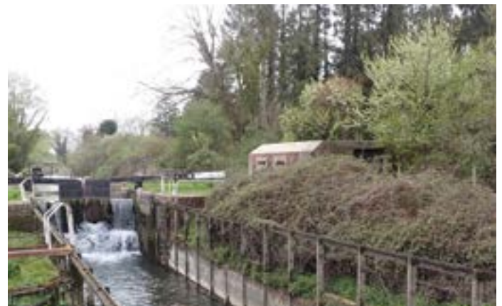
The bat cave at Garston Lock.

CRT have converted two pill boxes on the Kennet & Avon Canal to bat caves at Garston and Hamstead locks. Unlike the £100,000,000 HS2 bat tunnel, bats are expected to be on the inside. At the same time humans are locked out, avoiding the less savoury activity to which some of them have been subjected.