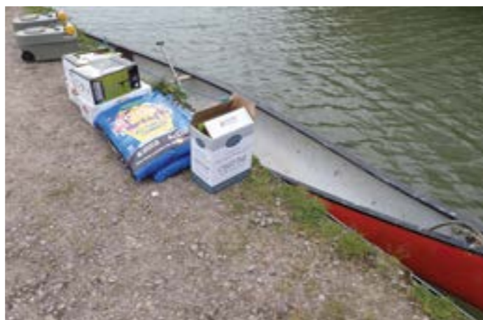
Seen at Great Bedwyn during DW, a fast C1 loading with compost and white wine. There's a story there somewhere.