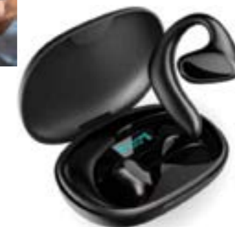
Sonobuds at £29.99 provide instant translation between any two of a gross of languages. A charge gives up to eight hours of availability.