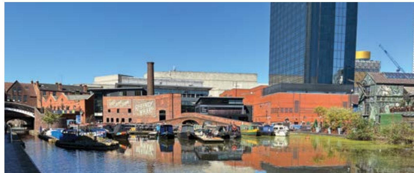
Gas Street Basin, the heart of the British canal system..

Adjacent is the Mailbox, formerly housing Birmingham's mail sorting office and now occupied by shops, restaurants and the BBC.