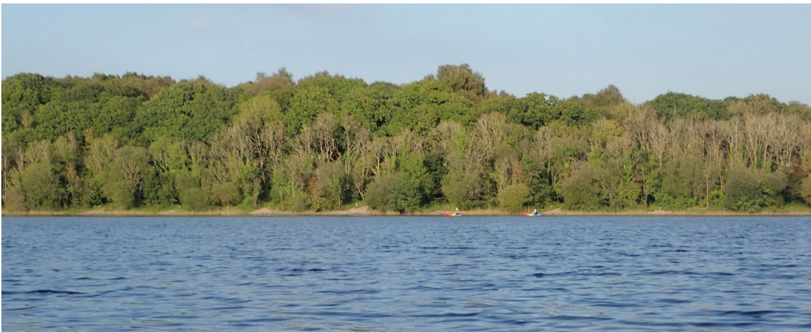
Exploring Garadice Lough's shoreline.