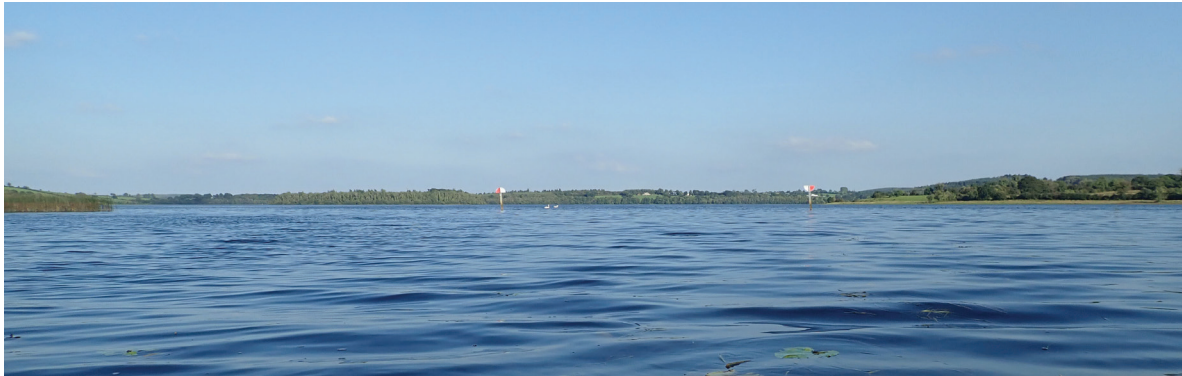
Marks indicate the navigation channel on Garadice Lough where the exit is not obvious.