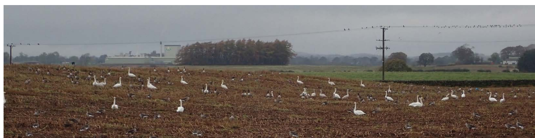
Whooper swans and Canada and greylag geese at Roberthill. Beyond is the Arla creamery.