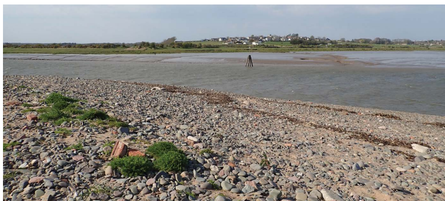
Looking from Barnkirk Point towards Waterfoot and Annan.