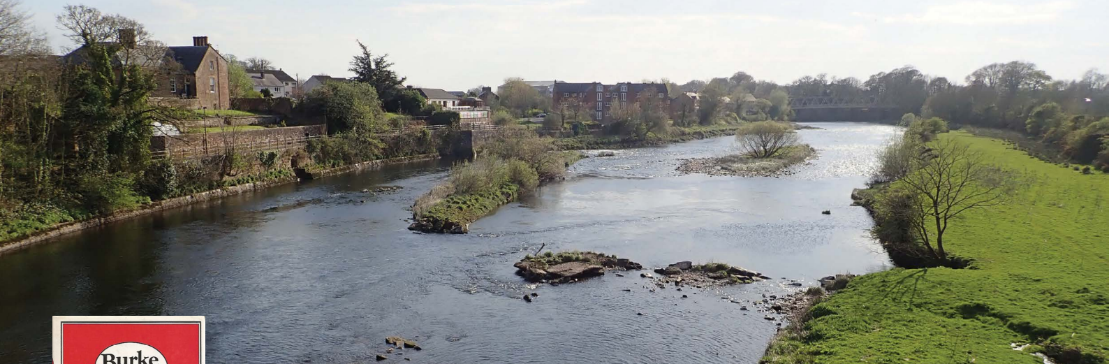
The remains of the weir at the tidal limit at Annan.