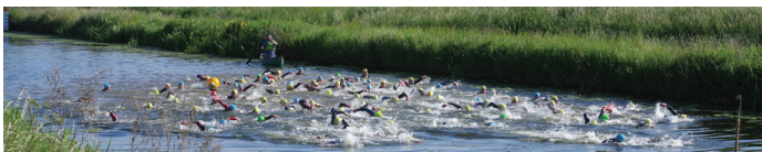
Heading away from the start on the swim leg.

From the end of the island before the M180 bridge the river became more busy with rowers although they did their best to keep out of the