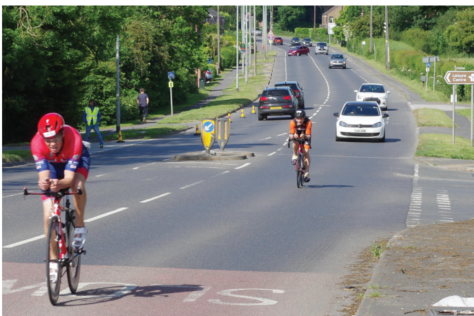
Fray approaches the finish of the cycle leg.