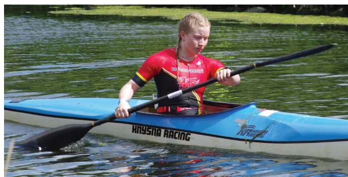
Ball was the only junior competitor.