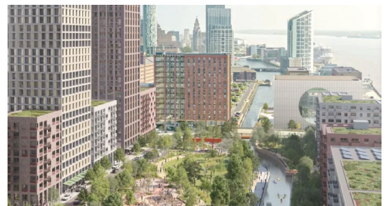
Infrastructure works valued at £71,000,000 have been awarded for the Central Docks section of the Liverpool Waters regeneration project. Publicity artwork includes the Liverpool Link being well used by kayaks.

In a country with 300-400 sports, their lordships did not reach double figures. There was some acceptance that ordinary people are involved, not just potential champions.